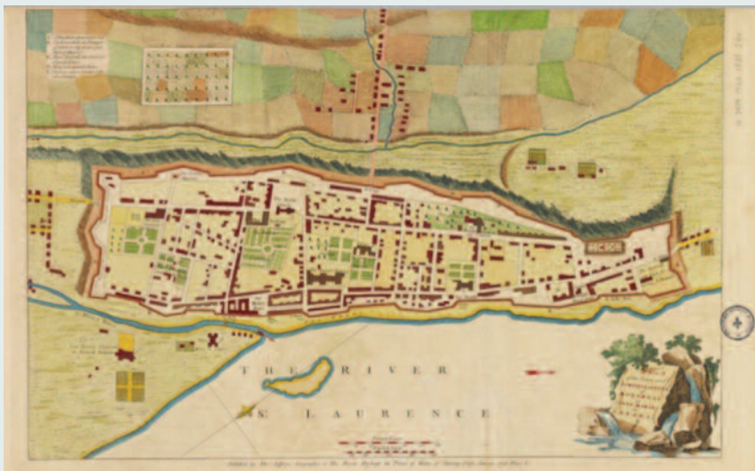
Thomas Jefferys, Plan of the Town and Fortifications of Montreal or Ville Marie in Canada, London, 1758.

Montreal and its surroundings. Some historians have nicknamed it the “spy map” since it was said to be based on the observations of a British spy present in Montreal between 1756 and 1758. Indeed, before the final victory, there was not supposed to be a Briton in Montreal. George III’s subjects would therefore, in principle, not have been able to draw such an accurate plan of the city.