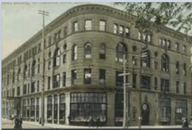
Birks, Sainte-Catherine Street. Architect: Edward Maxwell.

DURING THE 1940s, A GROUP OF YOUNG ARTISTS FROM THE ÉCOLE DU MEUBLE, THE ÉCOLE DES BEAUX-ARTS DE MONTRÉAL, AND THE SAINTE-MARIE, DE BRÉBEUF AND NOTRE-DAME COLLEGES GATHERED AROUND PAUL -ÉMILE BORDUAS, VISUAL ARTS TEACHER AND ENTHUSIASTIC ANIMATOR ON THE MOST CURRENT ART OF THE TIME.