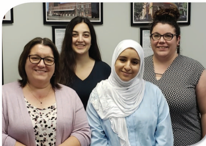
Socio-professional workers at the Carrefour